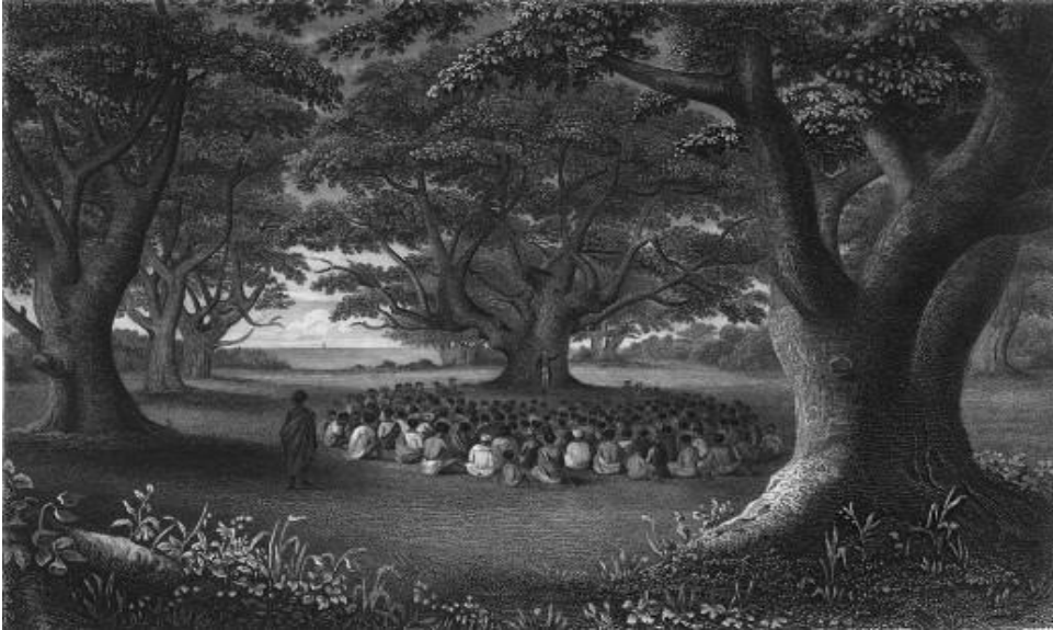
Missionaries preaching under kukui groves in the year 1841...